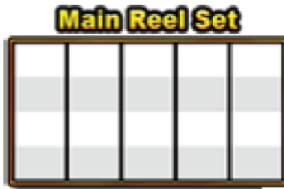
MAIN REEL SET 5 X 4